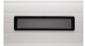
24" X 6" DOUBLE INSULATED ACRYLIC WINDOWS WITH BLACK FRAME