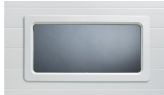
24" X 12" INSULATED GLASS Available with either a black or white frame.