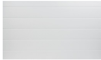
PENCIL GROOVE PANEL WITH STUCCO EMBOSSMENT